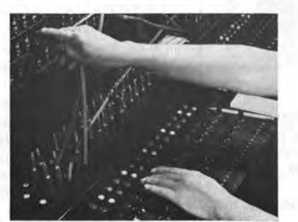
(5) Switchboard Operator